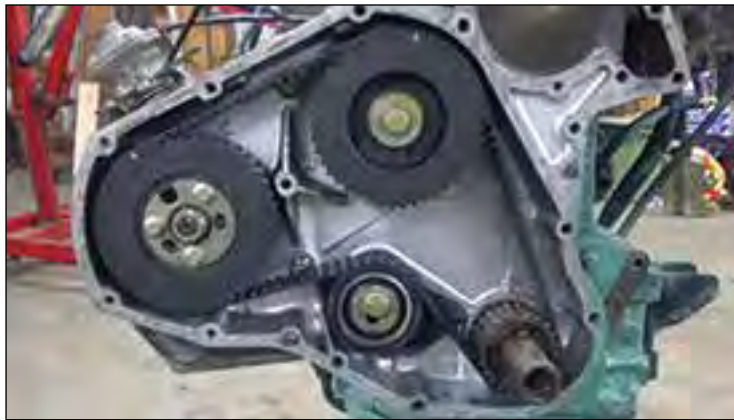
LandRoverPilot: New Belt in the tdi!