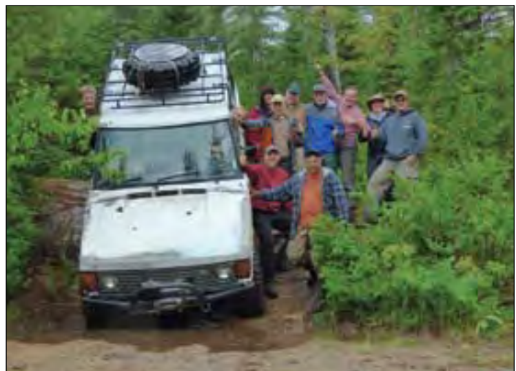
The whole gang.