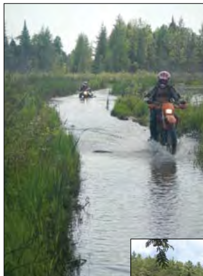
Our traveling companions.

We had decided as a group to leave about 9 in order to cover the roughly 200km laid out for day 1, and we did so within a few minutes. The first short leg was on gravel, then we did about 30 minutes on pavement, with a few false starts while we synchronized our 5 gps systems. The only maps given out were electronic, and while I had paper back up of the area, there were not many waypoints documented. What this meant was maybe a half dozen turn arounds once the gps