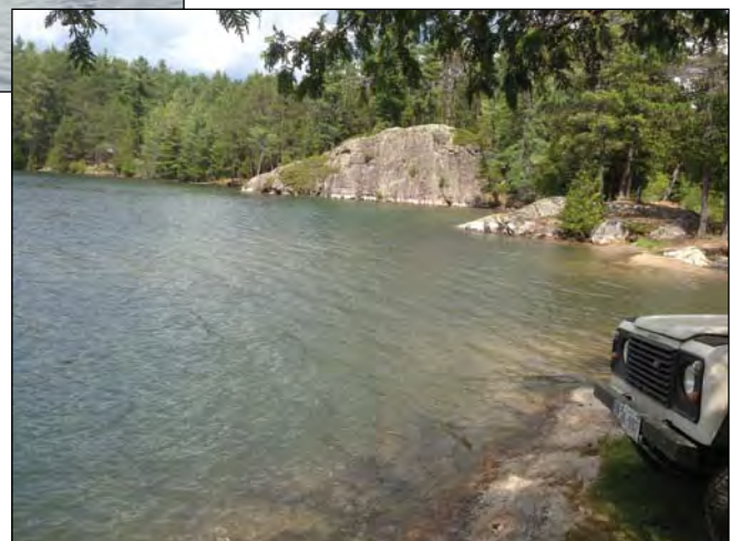
Kurt at the lake for lunch.

We finished the loop and returned to camp at 4:00pm just about when we wanted. There had been no casualties, no breakage and no towing required. So we settled in for dinner and had great evening just hanging around the fire and swapping stories. Toze from