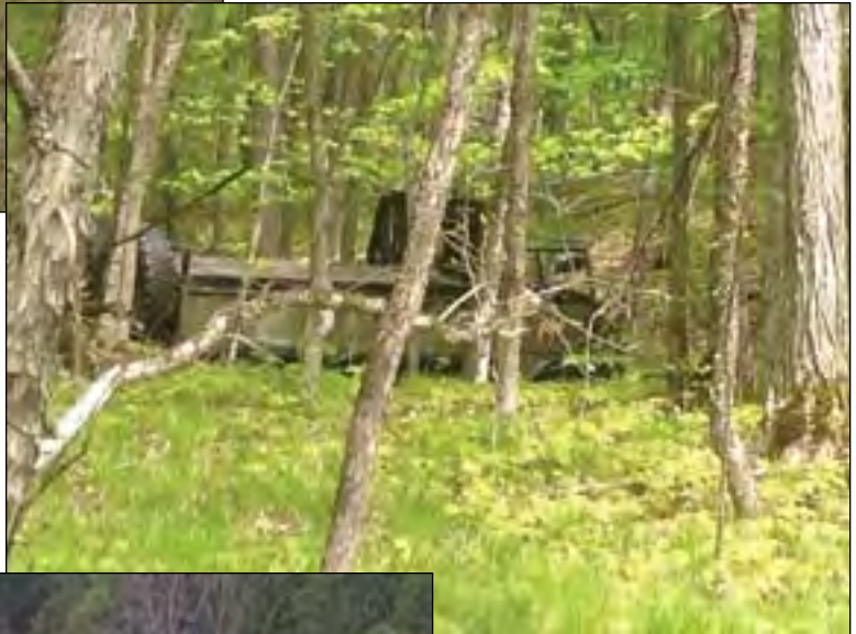
Francois and Moggy in stealth mode.