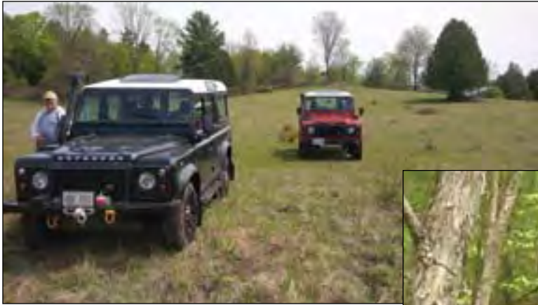
Defenders find the path.