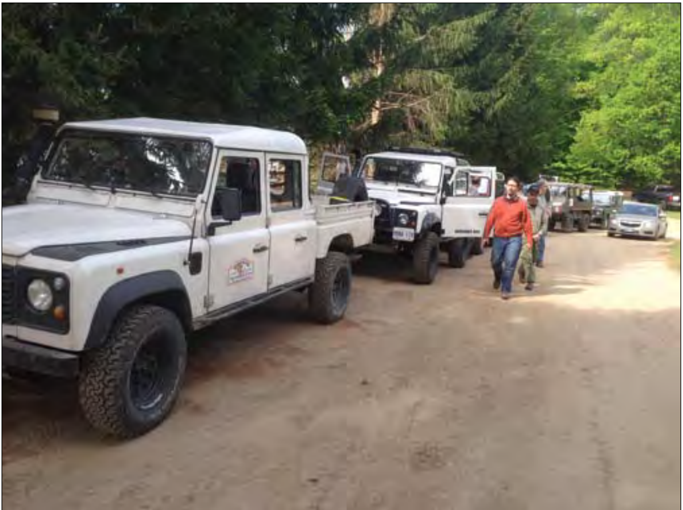
Report on Roaming Rally 2016 – The start of Day 2. (article and more photos on pages 6-8)