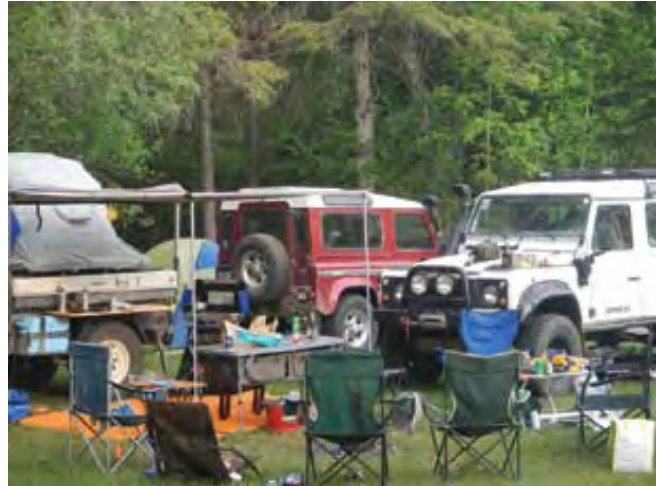
Campsite at Rideau.

saying “Go Right”, but they meant “Really Right”. We all got through in any case. Frankly, I don’t know how the bikes do it, they are much lower than us and don’t have snorkels, so I guess they walk, go around, or in some cases fall in, as one rider told us later.