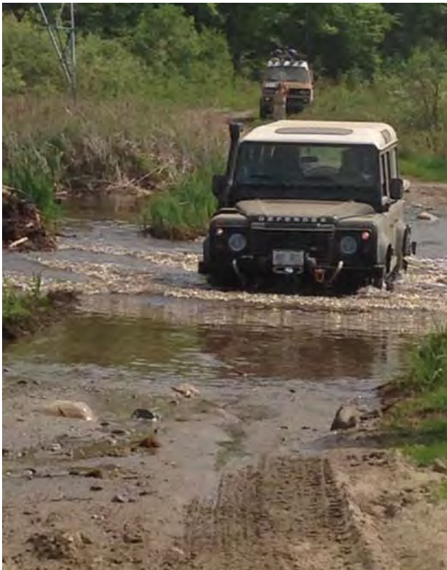
Kevin and CTX in the water.

We struggled to get the 7 vehicles all ready at once and left a little later than planned, but we got away in any case. The day started on pavement, changed to gravel then back to pavement for the first half hour then headed off to a nice hilly wooded trail with some water and some rocks, Not difficult but you needed to stay alert. We were also getting passed by bikes on occasion, so keeping eyes and ears open was necessary. As the day wore on the heat rose and we were also winding in and out of hydro lines and forests. The dust was very heavy at times, with maybe 100 feet of visibility in either direction. This slowed us down to a crawl at times, but we carried on. The hydro lines were necessary because they also provided the deepest water crossings of the weekend, usually in spots far from the woods. There are one or two photos that show the crossings. Kurt actually put his Defender vents under the water at one point because he was first and we had no point of reference on the depth. There was a group of bikers