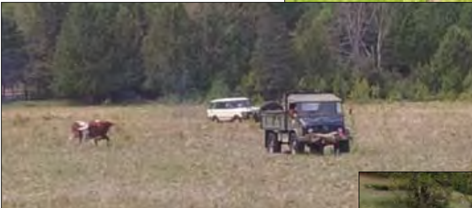
Francois pulls Ian from a cow pasture.