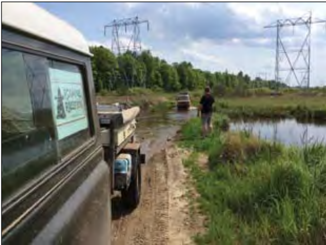
On a hydro line near Calabogie.