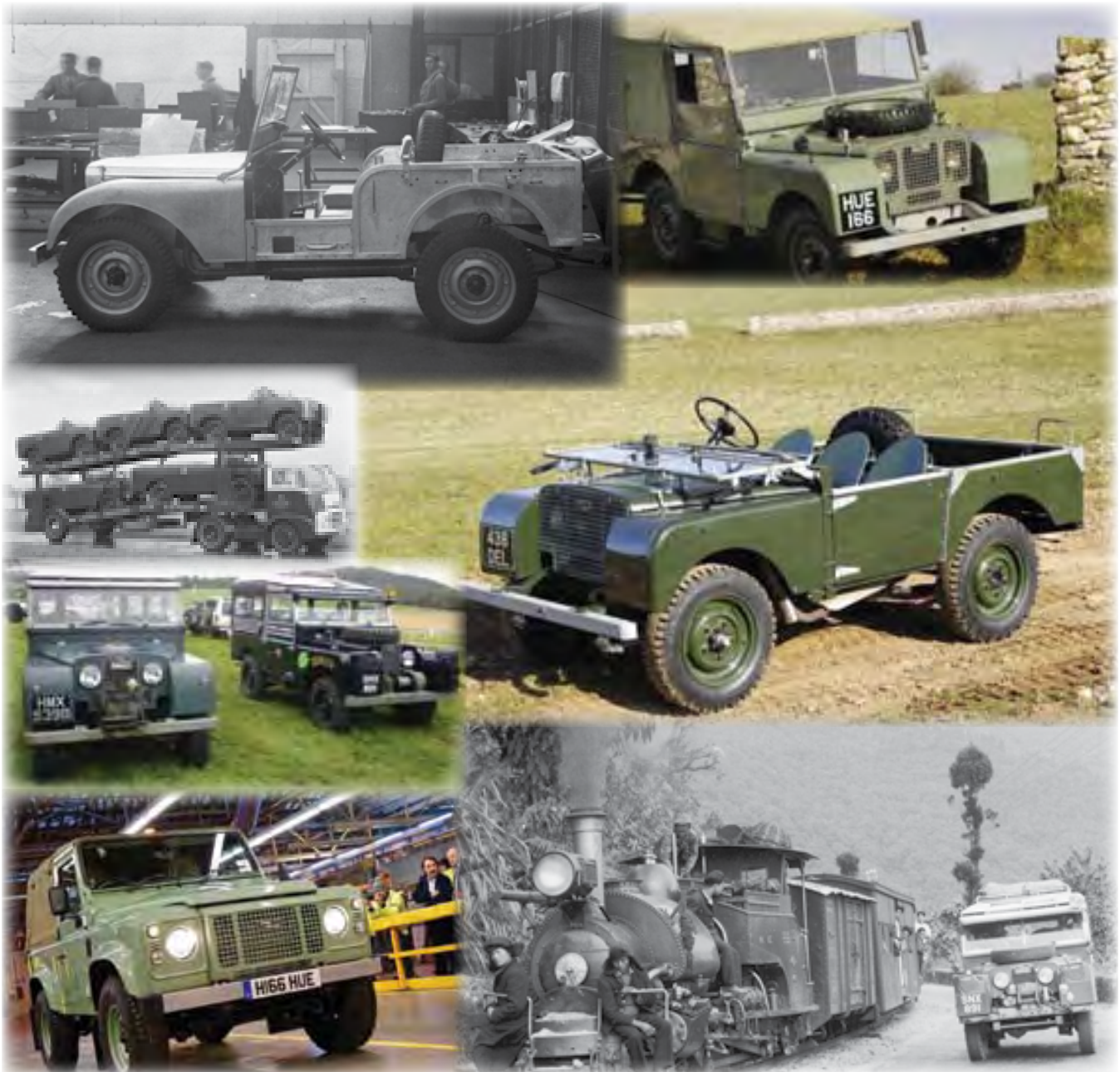
Prototype Series, HUE166 oldest Land Rover, HMX and SNX (middle) did the 1955 Far Eastern expedition, H166 HUE last of the breed. (Photos taken from the web – see related article on page 7.)