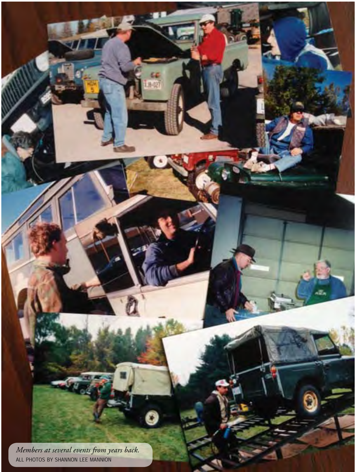
Members at several events from years back.