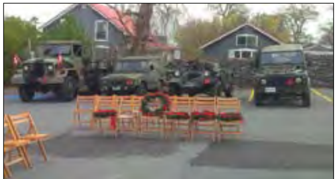
Land Rover Wolf attending Remembrance Day ceremony on Wolfe Island.