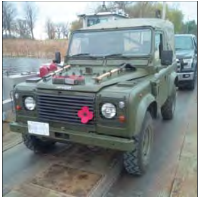
Land Rover Wolf on the Howe Island Township ferry en route to Wolfe Island Remembrance Day ceremony.