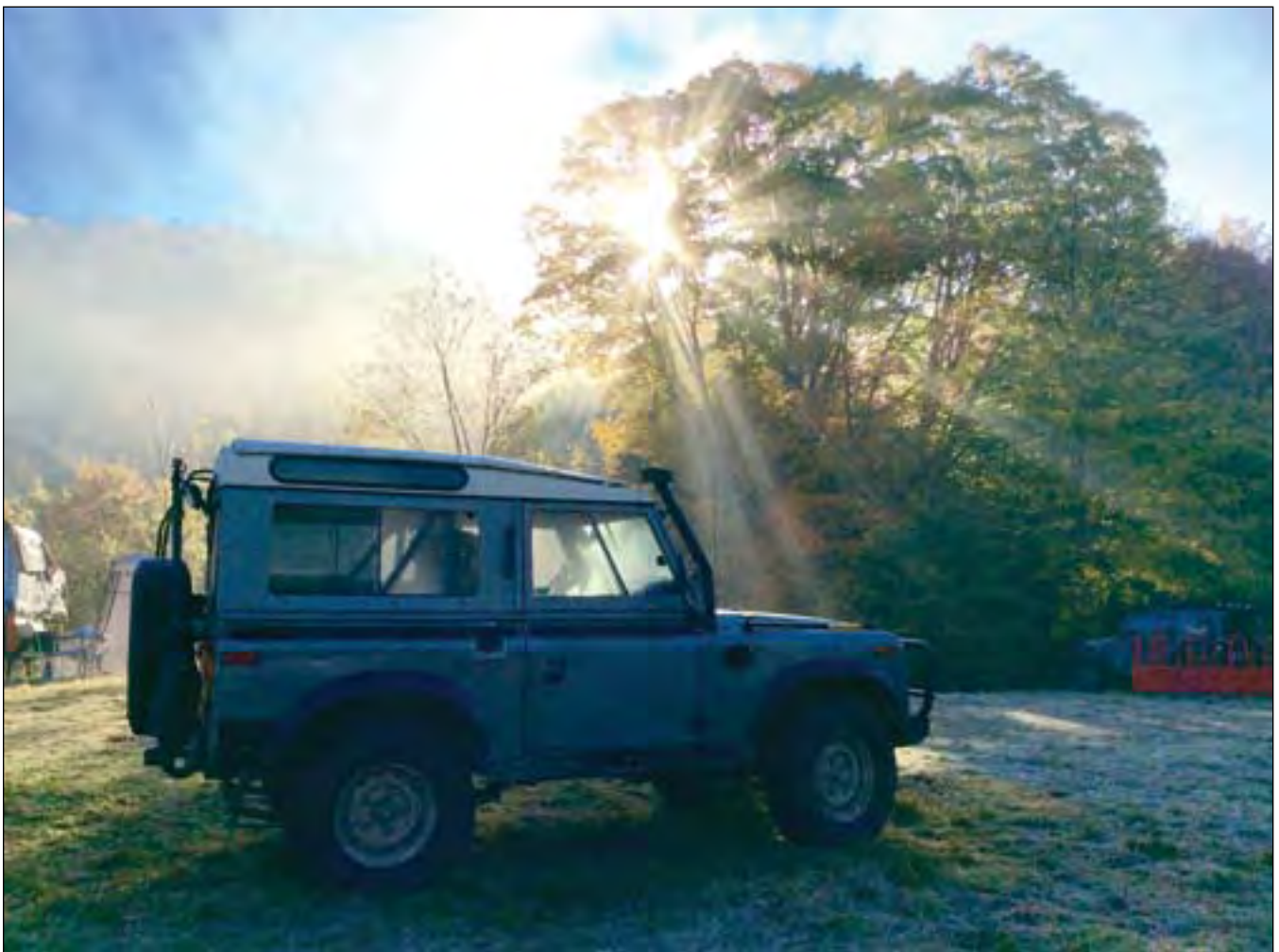
Sunrise in Vermont. (more photos on page 6)