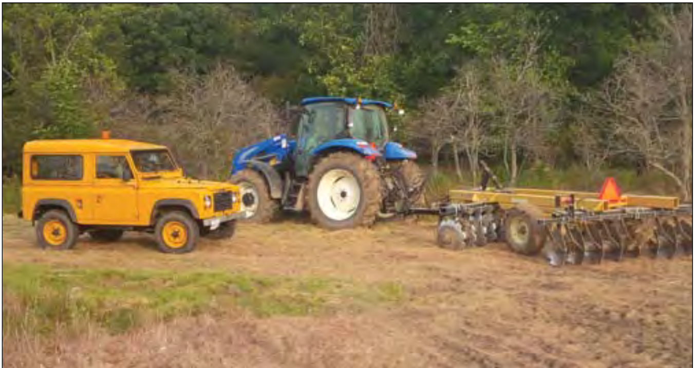
Down on the farm.