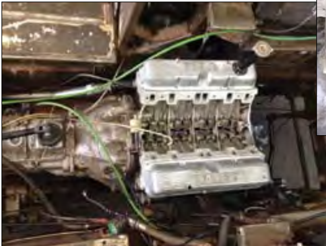
Reconditioned cylinder heads.