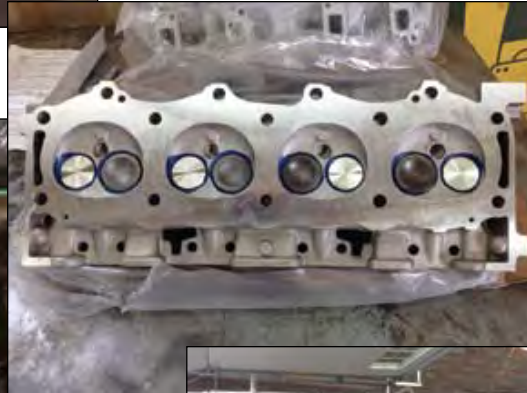
Top end rebuild in progress.