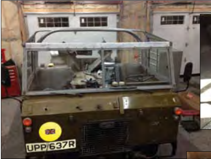
New glass and door tops.