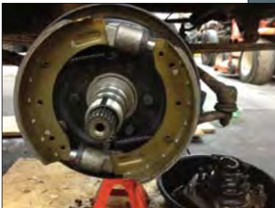
New brakes – pipes shoes and cylinders.