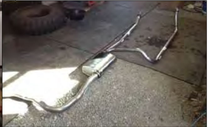
Stainless sports exhaust arrives.