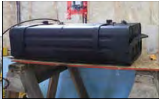
Fuel tank repaired and ready for refitting.