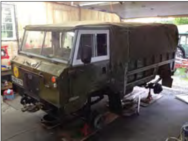
Looking better - the hover 101.