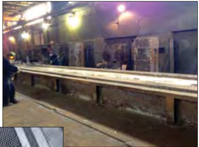
Kettle of Zinc