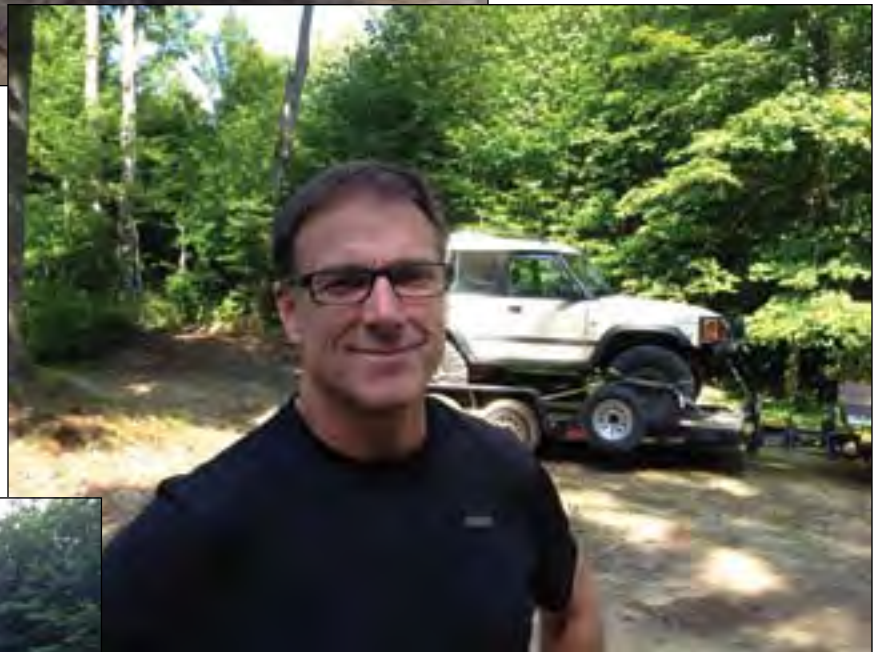
Patrick and the Monster Disco