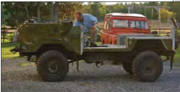
Outside under its own power – briefly.