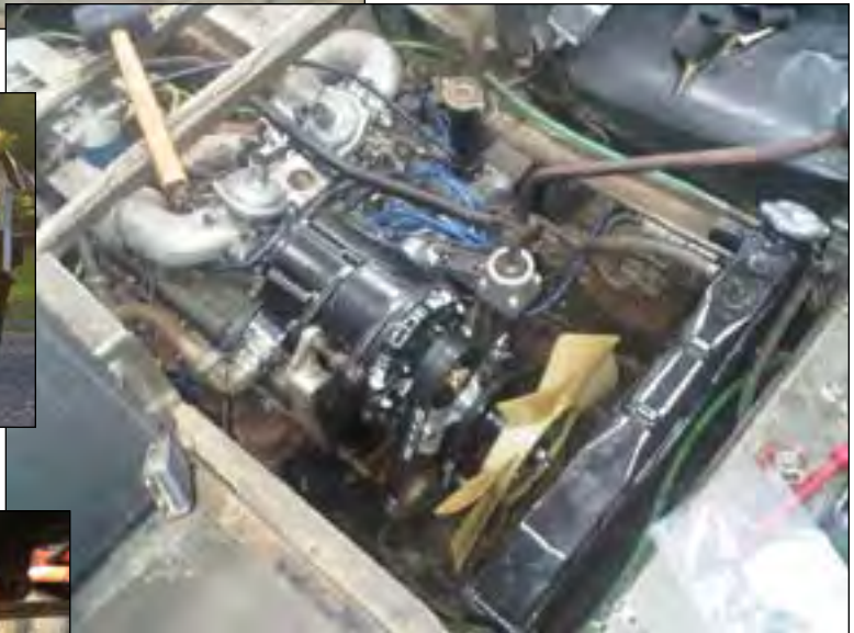
Pump alt rad belts and fan installed.