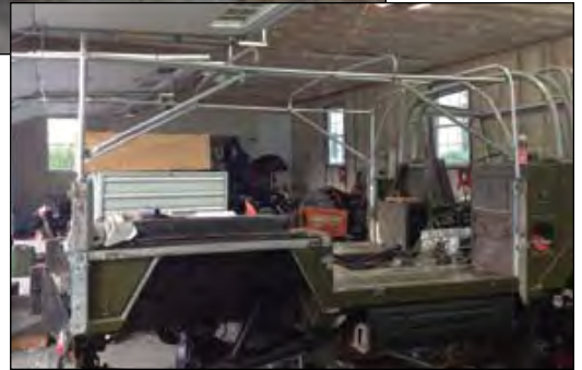
New frame for the tilt.