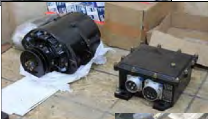
24 Volt alternator and control panel ready for refit.