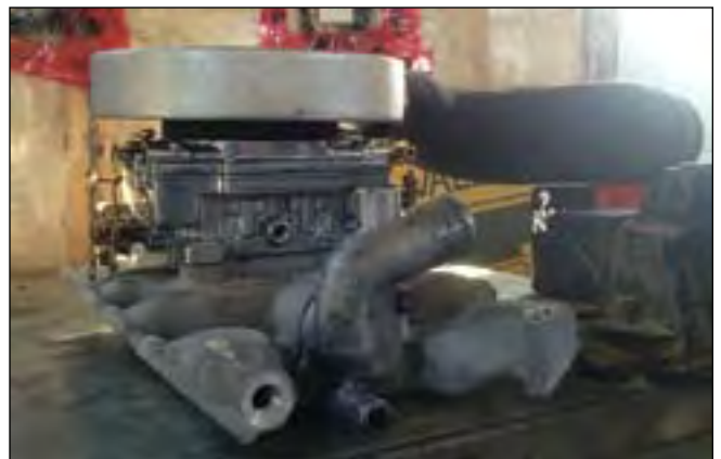
Salvation - the Edelbrock.