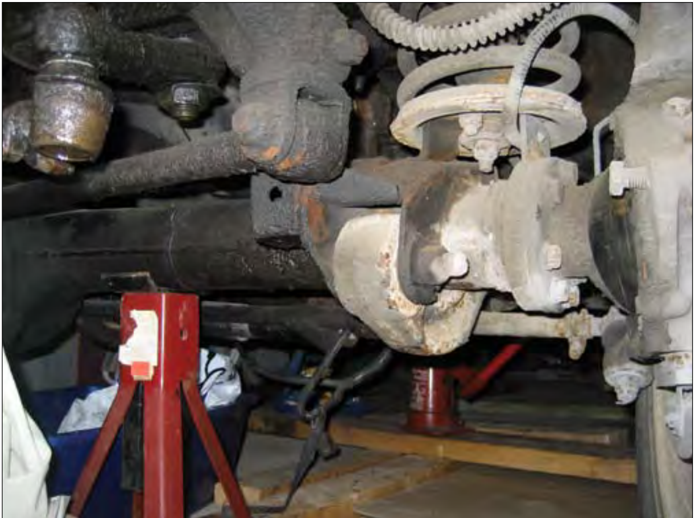
Where I spent my summer.