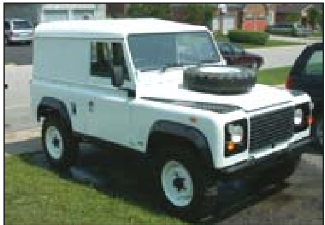
90 NA diesel