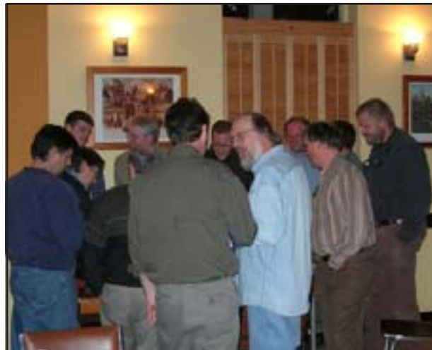
The guys swarming