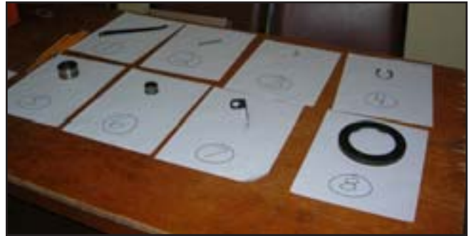
The Seelie - Meelie waiting