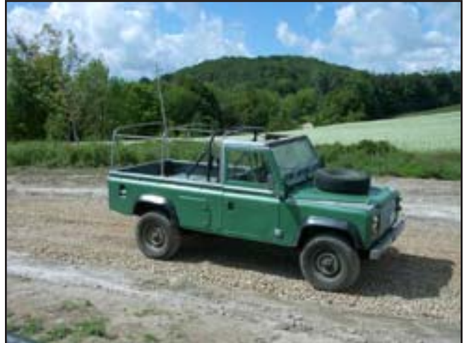
Ex-military 110 NA diesel

Low mileage repainted and re-newed ex-military 110 NA diesel, 5-speed with roll bar, new soft top, re-built transmission 35,000 Km's: & 90 NA diesel, 5-speed 84,000 Km's hardtop, both right-hand drive, bodies and frames in excellent condition ... for additional information contact matthewsted@aol.com