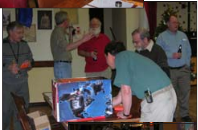
The gang gesticulating