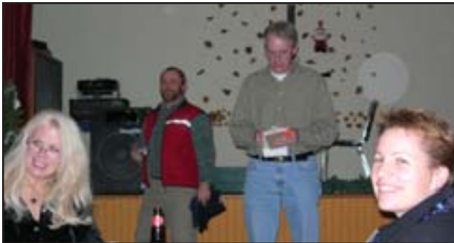
The fans smiling