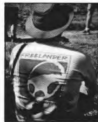
Freelanders Forever! (Shannon)