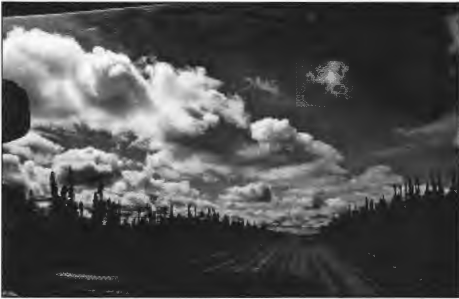
Big Sky above the highway. (Robert St-Louis)

After getting used to the road-handling of the truck, the manual steering, the suspension, the gear shifting, it proved a pleasure to drive it down those long stretches of gravel road (in between the more treacherous pothole-infested areas). Looking out the front windshield, over the spare tire characteristically mounted on the bonnet made me feel really glad to be alive doing this unusual but rewarding trip. The vicissitudes of work were very far from my mind on this first week of my holidays!