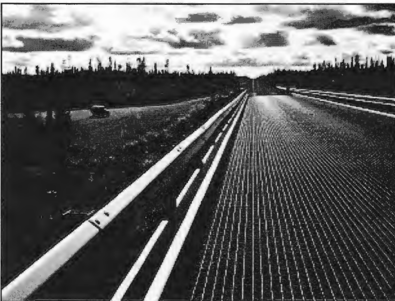
Bridge crossing the (diverted) Churchill River (near Churchill Falls). (Robert St-Louis)

After getting used to the road-handling of the truck, the manual steering, the suspension, the gear shifting, it proved a pleasure to drive it down those long stretches of gravel road (in between the more treacherous pothole-infested areas). Looking out the front windshield, over the spare tire characteristically mounted on the bonnet made me feel really glad to be alive doing this unusual but rewarding trip. The vicissitudes of work were very far from my mind on this first week of my holidays!