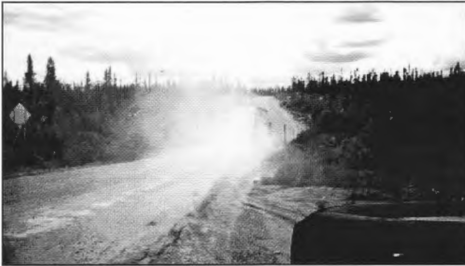
Sample of the dust raised by large transport trucks. (Robert St-Louis)

infrastructure and services that Newfoundlanders benefit on the island. After another one of our frequent visits to Tim Hortons (a welcome presence in all the towns up there), we headed back out on the road towards Fermont and Manicouagan (our destination for that day).