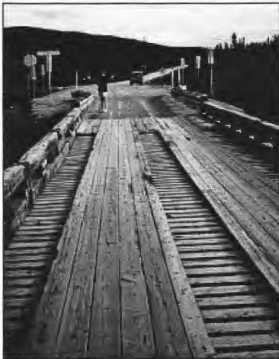
The one-car bridge crossing Hart-Jaune River, in Quebec.

Once in Baie Comeau, I breathed a huge sigh of relief. We had driven what I felt was the most demanding half of the journey, over 1,100 km of road, a lot of it gravel through very remote country that would have been very unforgiving of two tourists standing beside a broken-down 16-year-old Land Rover. The truck performed marvelously in retrospect. After all, is there a better vehicle in the world that one would wish to take on such a trek? (Ok, so a brand new Ford Explorer or Jeep Cherokee wouldn't have been too bad either with automatic