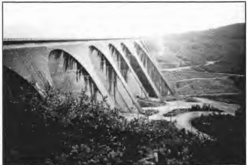
View from the side of impressive Manic 5 dam.

After two or three hours of this kind of driving, I was really looking forward to arriving at Manicouagan for the night. Darkness was falling, and I was obliged to use the headlights for the first time on the trip, climbing all those steep hills having slowed down our progress. Approaching Manicouagan, the road became very windy and hilly, and we were forced to slow down for steep corners, made worse by the gathering darkness. Eventually, we looked up to see the gigantic arches of the Manic 5 reservoir looming over us out of the mist and fog. What a sight that was! Ominous, and yet welcome, since we knew we had arrived and could look forward to a good night's sleep at the motel and truck stop that basically constitutes the "village", along with the Hydro-Quebec buildings and tourist site. We bought sandwiches at the all-night truck stop, and ate them in our room. I treated myself to the only beer I had on the trip, which I felt I had earned with that day's arduous drive.