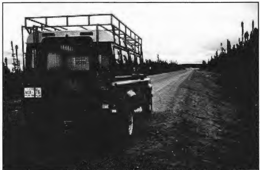
The 110 poised for the open road.

I spent those first couple of hours (and occasional instances after that) avoiding significant potholes and ruts in the road, which slowed down our progress somewhat. Somewhere along this stretch, we passed a Toyota Echo, which I couldn't believe was trying to make the trek on that treacherous road when I was struggling myself in a 4x4 Land Rover. I was amazed to see this Echo pass us with considerable gusto a few hours later though I wonder