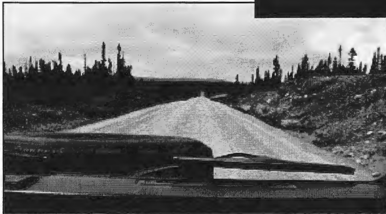
A view over the bonnet, on the TransLabrador Highway 500. (Robert St-Louis)

what shape it was in when it arrived at its destination. A man I talked to in Goose Bay had come up from Montreal the previous week with two 53-foot trucks carrying lockers for a new high school in town; both trucks were apparently damaged by the journey and were then being repaired in town.