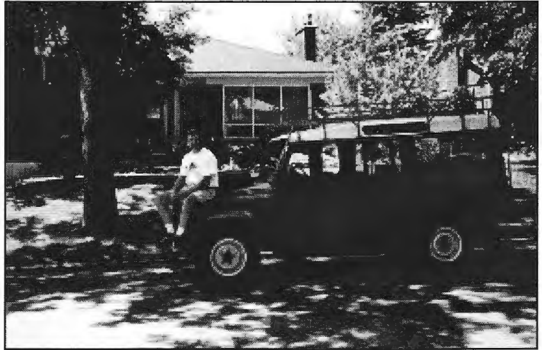
The 110 got us home!

P.S. There are some excellent Internet resources on these roads and the people who have travelled them in the past (including Land Rover clubs in Northeastern US). Some of the more informative ones and recommended reading to anyone contemplating such a trip are: