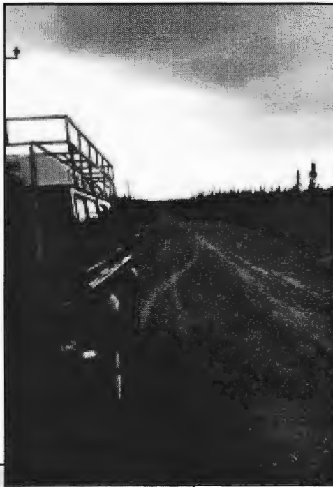
110 resting on a desolate stretch. (Robert St-Louis)

The Labrador 500 highway leaving Goose Bay due West is gravel and was in poor condition for at least a couple of hours due to almost incessant rains that had come down in the area since we had arrived. However, the blessing was that it eliminated the dust usually rising from the road.