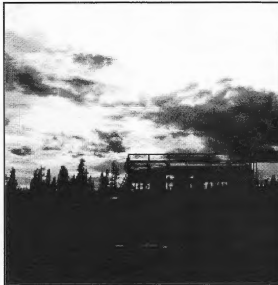
110 silhouetted against late afternoon boreal forest. (Robert St-Louis)

At one point, we stopped and looked ahead in disbelief: the road went down and