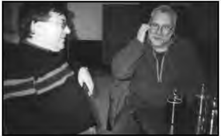
"Oh no, I can simply peel the beard off. Watch!"