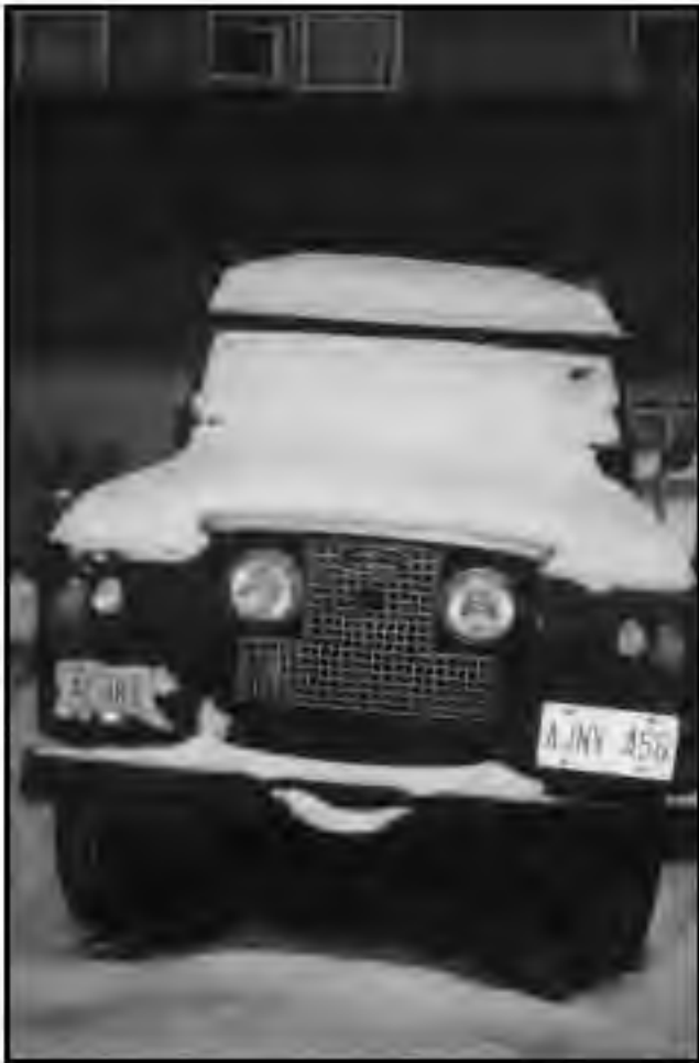
This could be your Rover. At least, if you lived near Shannon and she stalked you. See page 9.