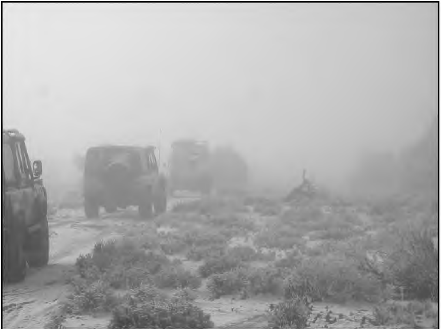
Yes, they're lost. Sevin Mile Rim trail, Moab on December 29.

More photos may be found at http://keith.miata.net/postcards