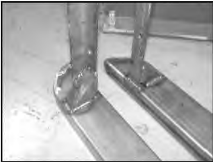
The rear mounting points. While the attachment is solid, the weakest point is the unsupported angle iron before it attaches to the outrigger.

Now, how to protect the protection? Let me say that POR-15 is fantastic stuff. A quick coat protects from rust and won't scratch without some serious effort. If Land Rover had used POR at the factory there would be no market for galvanized frames. But I digress. A shot of body colour on top of the POR blends the sliders into place.