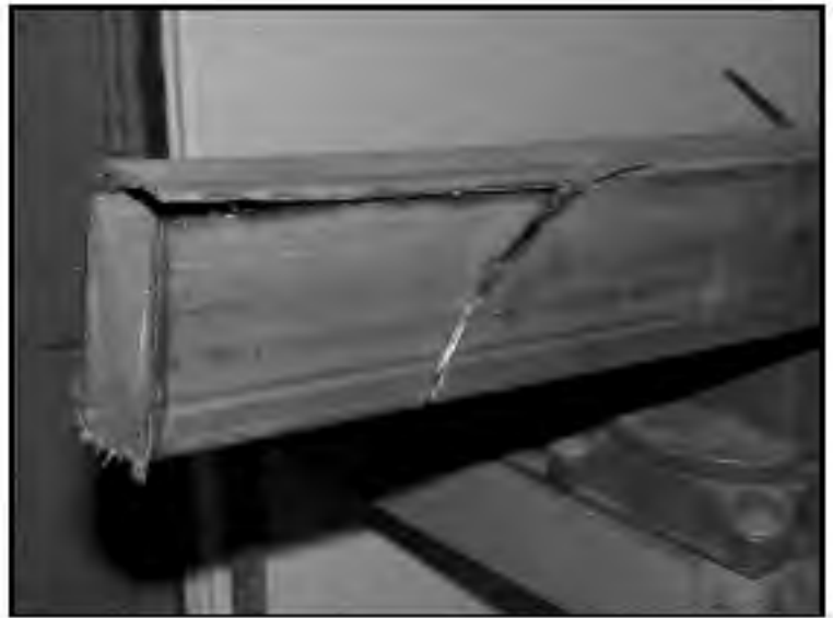
The first cut. Note how the bottom (well, it's on top here) is left attached so it can be bent around.

The sliders are placed to protrude slightly from the body. The photo at right illustrates why - they need to be the first point of contact. They also should have a gap between the top of the slider and the door, just in case something does get mangled. I actually left the standard sill mounts in place and have the slider pressed up against them.