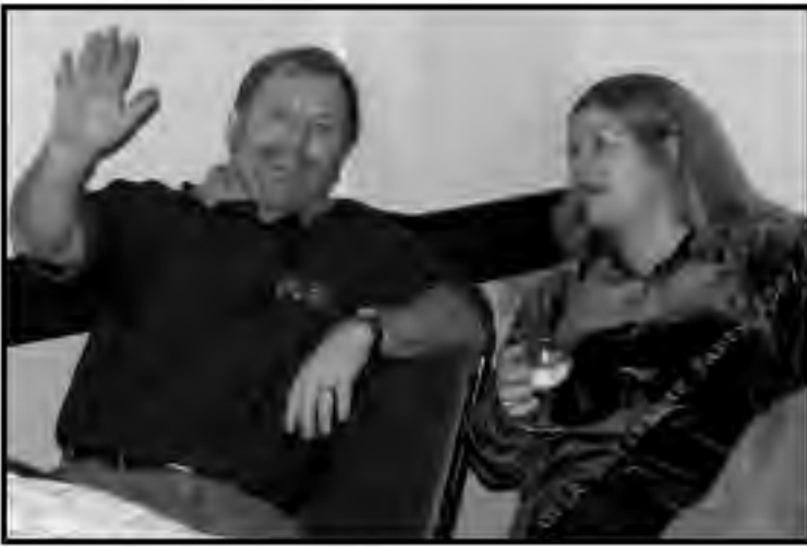
Another OVLR caption contest! We won't ask for entries, because we know you won't send them. So just mumble them to yourself.