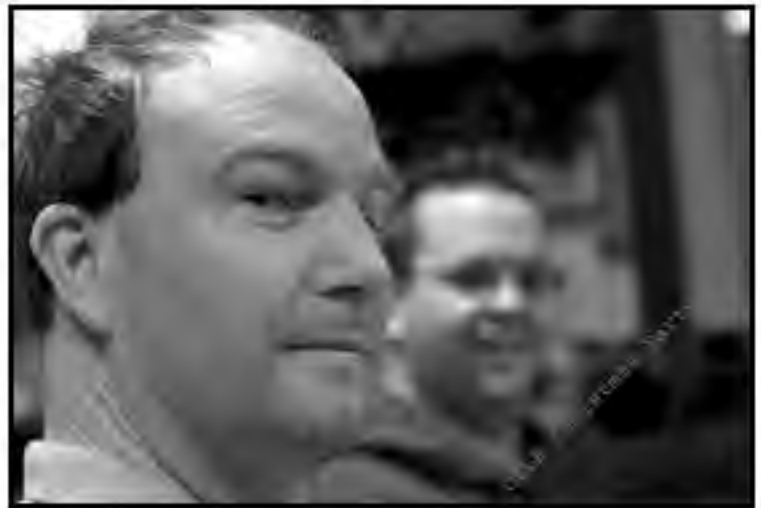
More mind control.