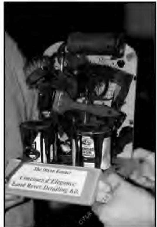
It takes years of dedication and attention to detail to attain this level of recognition.