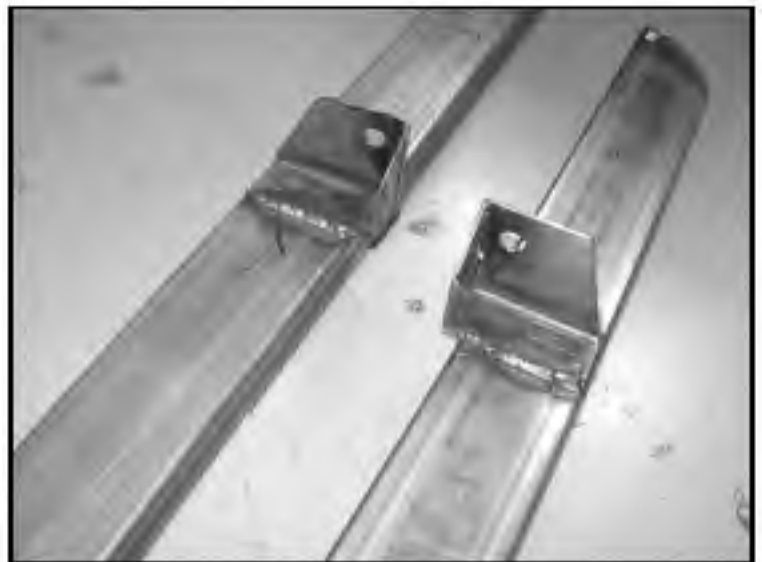
The front mounting points welded in place.