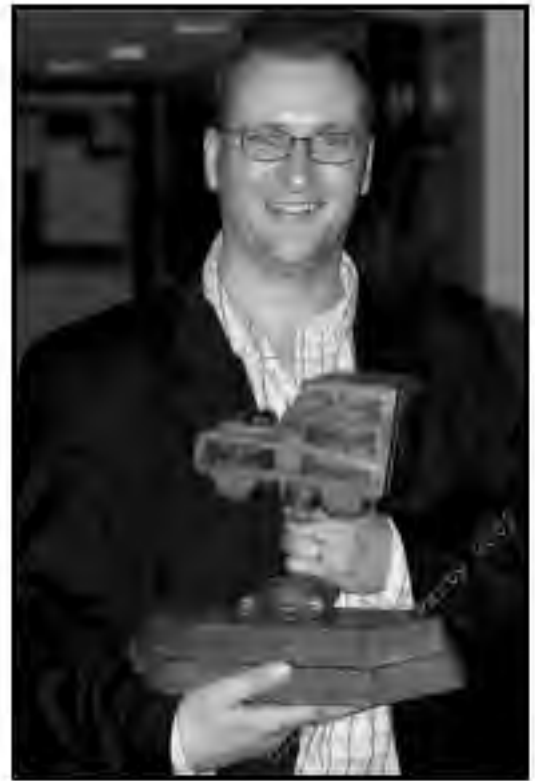
????, winner of the Lugnut award.