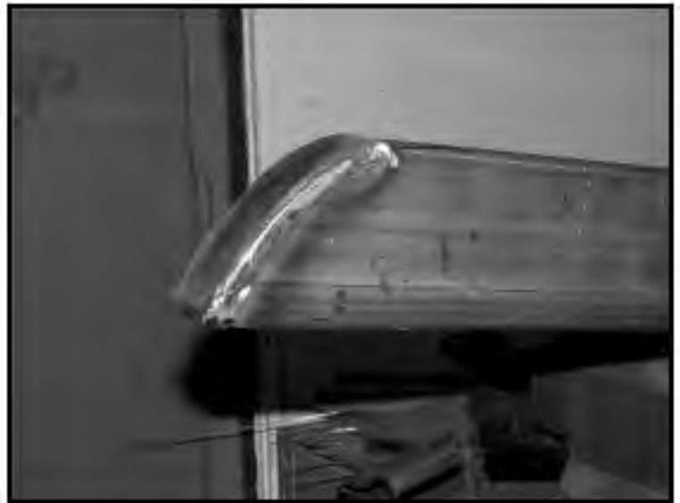
One corner welded up. Three to go.