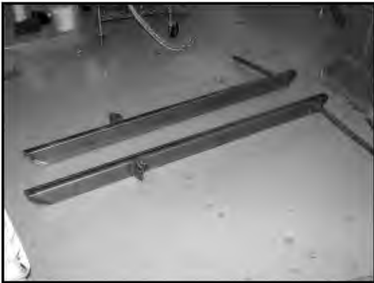
Two sliders, ready to be painted and mounted.

Do you have a modification on your truck that would benefit other OVLRL members? What's your favourite LR trick to soothe the aluminium beast? Share it with the OVLRL and gain fame and fortune! Well, fame anyhow. But it's better than nothing, and it may be the best offer you get all day. Write an article for the newsletter!